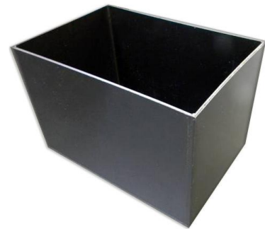
Solvent waste storage