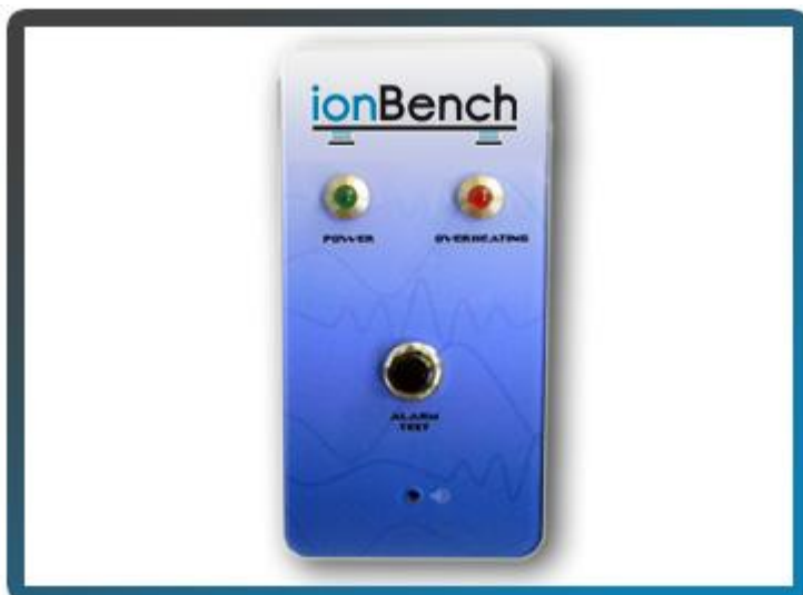
Overheating temperature alarm