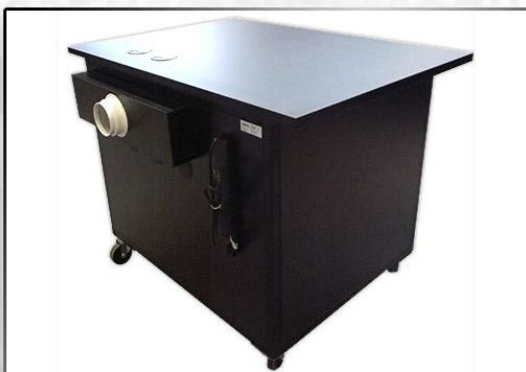
Heat Removal Module