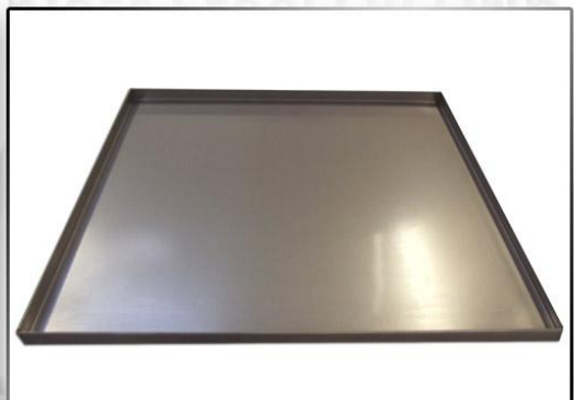
Stainless Steel Oil Drip Pan