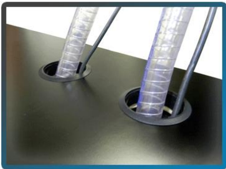
Pipe and cable management