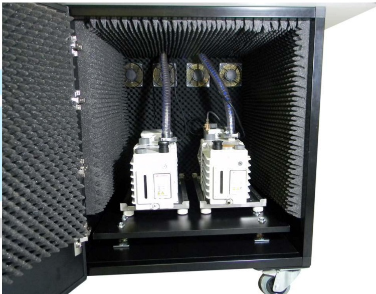
Noise enclosure for vacuum pumps