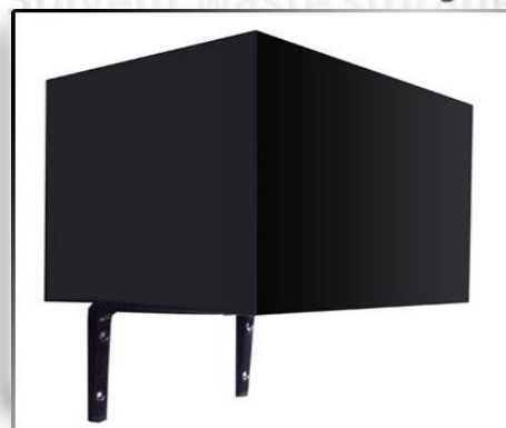
Lateral solvent waste storage