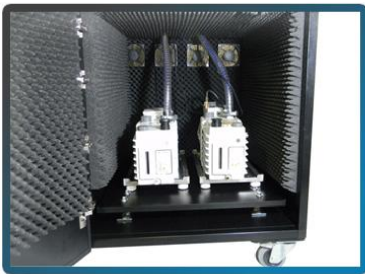
Noise enclosure for vacuum pumps